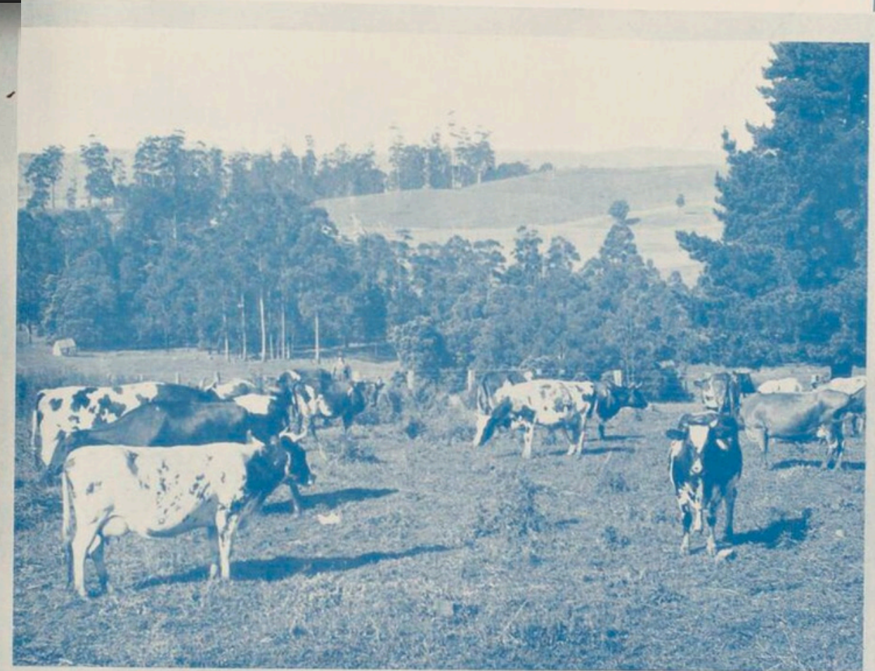
THE AUSTRALIAN COUNTRYSIDE

OFFERS INFINITE OPPORTUNITIES AND ATTRACTIONS TO MEN AND WOMEN WHO ARE KEEN TO MAKE THEIR WAY IN THE WORLD.